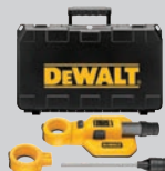
DWH050K LARGE HAMMER DUST EXTRACTION - HOLE CLEANING