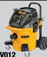
DWV012 10-GALLON HEPA/RRP WET/DRY DUST EXTRACTOR

*For 20V MAX* Maximum initial battery voltage (measured without a workload) is 20 volts. Nominal voltage is 18. **Maximum initial battery voltage (measured without a workload) is 20 and 60 volts. Nominal voltage is 18 and 54.