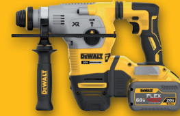
DCH293 1-1/8" 20V MAX** SDS Plus Rotary Hammer