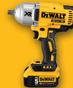
DCF899 1/2" 20V MAX** High Torque Impact Wrench