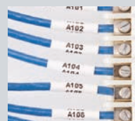
PermaSleeve® wire markers