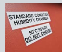
Lean / 5S labels and operations ID