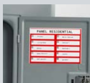
Residential panel labeling