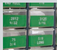
General ID labeling