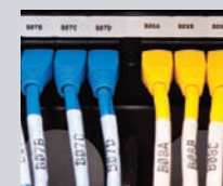
Voice and data communications