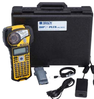
BMP21-PLUS Printer Kit shown.