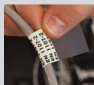
Self-laminating wire labels