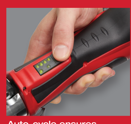
Auto-cycle ensures full press every time