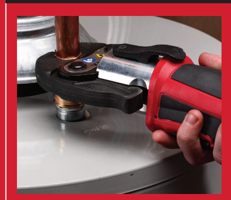
Easy open jaw for one-handed use