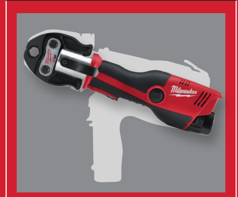
Lightest, in-line design for unrivaled access