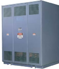
Style F—NEMA 1 Rated