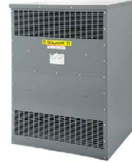
Style J—Type 1 Rated Converts to Type 2 with Drip Shield Converts to Type 3R with Weathershield