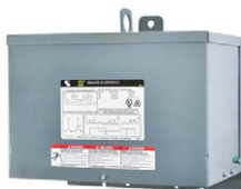
Type T and Type TF