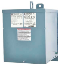
Style B—Type 3R Rated