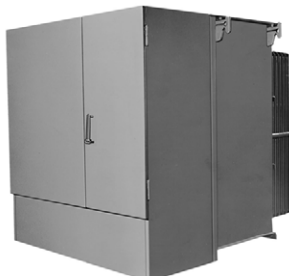
Liquid Filled Pad Mounted