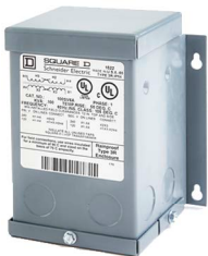
Style A—Type 3R Rated