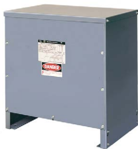
Style E—IP55 Rated

These dimensions are not for construction. Contact your local Schneider Electric representative for certified prints.