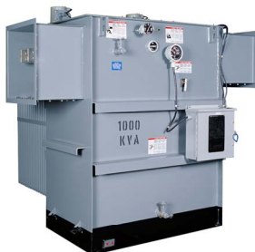
Liquid Filled Substation