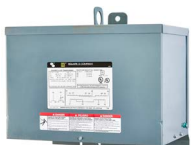
Style C—Type 3R Rated