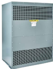
General Purpose Dry Type 600 Volts and Below