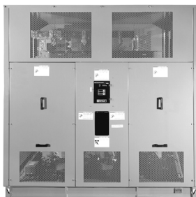
Power Dry II™