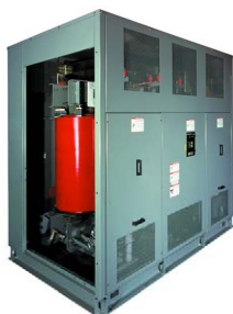
Power Cast II™

New! Revised Medium Voltage Transformer Energy Efficiency Information For 2016! In 2010 Schneider Electric released new efficiencies for MV transformers based on The Department of Energy (DOE) 10 CFR Part 431 Energy Conservation program for Commercial Equipment. We are now launching even more efficient transformers to further reduce energy consumption from MV transformers. Starting January 1, 2016 certain medium voltage distribution transformers with ratings of 2,500 kVA and below, 34.5 kV primary and below and 600 Vac class secondary voltages must meet revised minimum efficiency requirements. Liquid Filled Padmounts, Liquid Filled Substations, Dry Type VPI and Power Cast products shipped after January 1, 2016 will all be included. The minimum efficiency tables are listed below. Please contact your nearest Schneider Electric Sales Office for more information. Page 14-19 and 14-20 includes our updated offer.