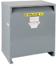
Style D and H—Type 2 Rated Converts to Type 3R with Weathershield