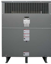
Style D, NEMA 1 Rated