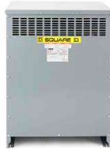
Style K—Type 1 Rated Converts to Type 2 with Drip Shield Converts to Type 3R with Weathershield