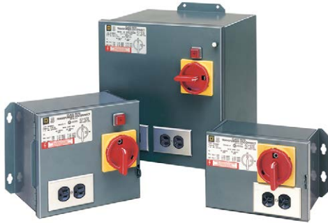
Transformer disconnects are available in NEMA Type 1 Standard, NEMA Type 12 Standard, and NEMA Type 1 Mini.

Square D™ brand transformer disconnects mount inside or outside a control system enclosure. The transformer disconnect being connected directly to the 480 Vac system controls power for auxiliary, single-phase loads when the main three-phase disconnect is either ON or OFF. The transformer disconnect is normally wired to the line side of the control panel's main disconnect.