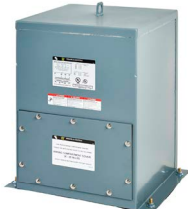
Style X—Type 4X Rated